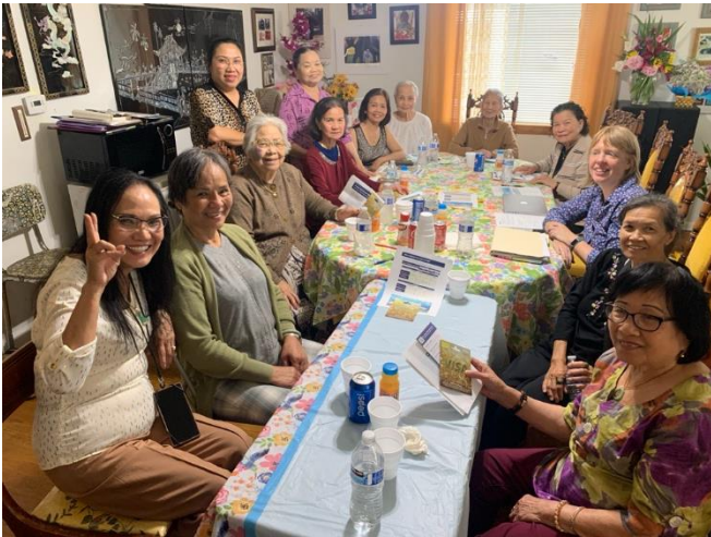
Focus group in Tacoma with Vietnamese Sunflower dance troupe members.

Staff engaged with a variety of historically underserved communities in four focus groups to understand their needs, travel patterns, barriers to riding the train, and how the S Line could better serve them. Across all focus groups, the strongest interest was in adding weekend service, with many indicating they would use Sounder at least once a month for recreational purposes such as sightseeing and shopping. There was also strong interest in additional weekday services at a variety of times, including early morning, late morning, midday and evenings in both directions to better support swing and graveyard shifts.