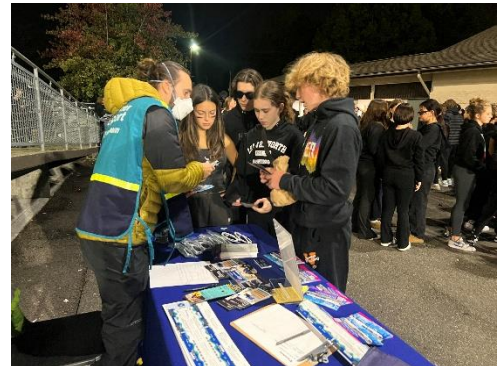
Sumner vs Graham-Kapowsin football game