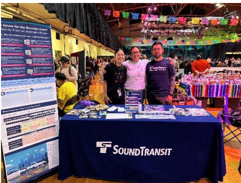
Tacoma LatinX Festival

Staff also conducted interviews with organizations throughout the corridor. There were a variety of themes from these conversations, including: desire for more midday service mid-week; desire for more "reverse commute" trips among Pierce County employees; strong desire for weekend service, particularly in summer, from Pierce and South King County tourism destinations; and a desire for more midday service (both directions) for UW-Tacoma students.