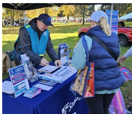
Auburn Halloween Harvest Festival